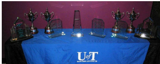
Awards and Trophies for U of T SAE

Likewise, the team at AXIS Prototypes was proud to be part of the 2008 winning team at the U of T and looks forward to helping in the future.