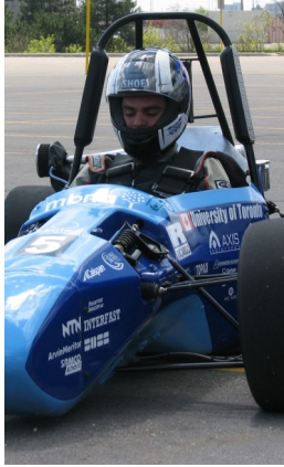
On your Marks...

The University of Toronto celebrated its tenth year of competition in Formula SAE . This year, the showdown was held at the Michigan International Speedway, just south of Detroit. Over 120 teams from six continents competed on a number of platforms which included both kinetic events such as braking, acceleration, and endurance, and static events such as a Marketing Presentation, a Cost Report, and Design.